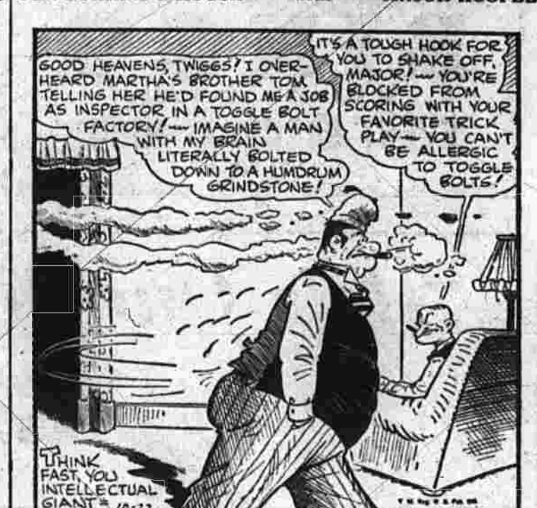
MAJOR HOOPLES WITH MAJOR HOOPLES