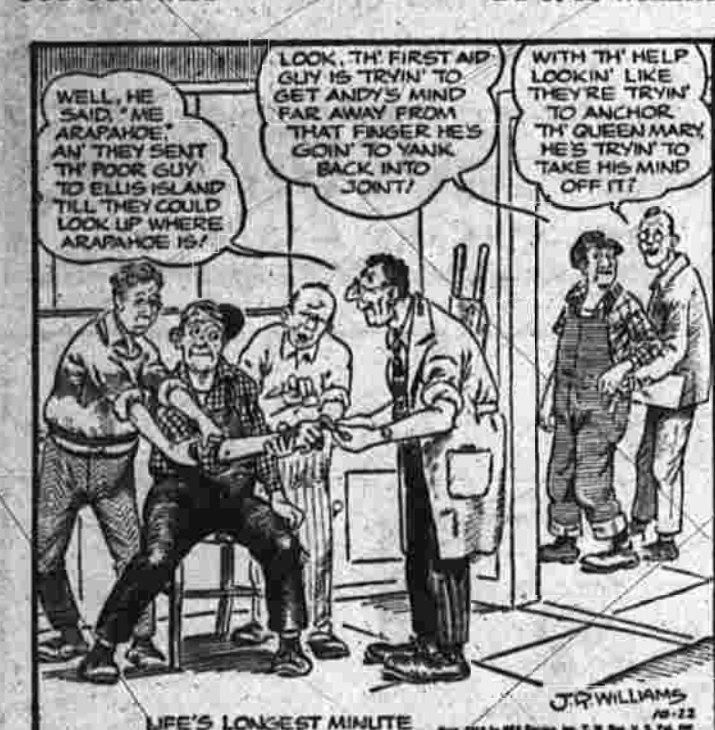
OUR BOARDING HOUSE BY J. R. WILLIAMS