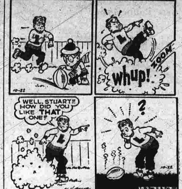
PRISCILLA'S POP BY AL. VERMEER