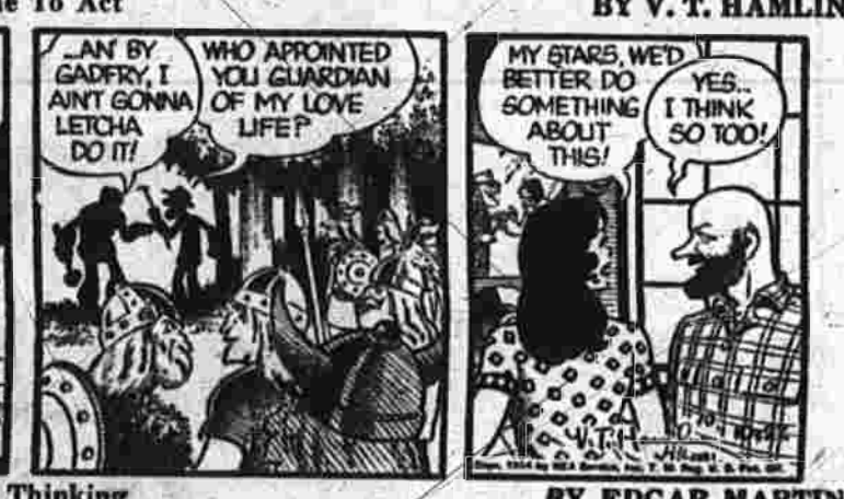
TIME TO ACT BY V. T. HAMLIN